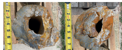
6.9" OD Slip Proof Landing String, V150 Side Load & Compression