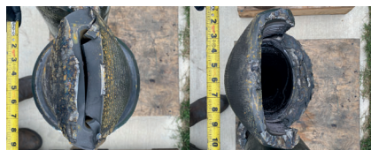
8.5" OD Tool Joint Landing String, V150