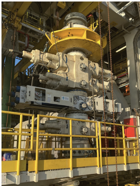
13-10M K-BOS on Peregrino-C

Kinetic's 13-5/8" bore 10,000 psi rated K-BOS ("13-10M K-BOS") has been optimized for surface drilling and completion applications and can "Shear Anything" (work string BHAs, tool joints, and heavy casing) and "Seal Instantly", offering a dramatic increase in shearing and sealing capability compared to typical 13-5/8" 10,000 psi BOP stacks.