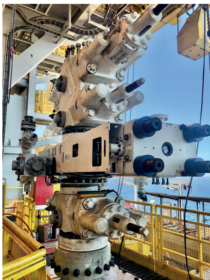
Shown Left: K-BOS added to a BOP stack as a replacement for the drilling cross flow spool.