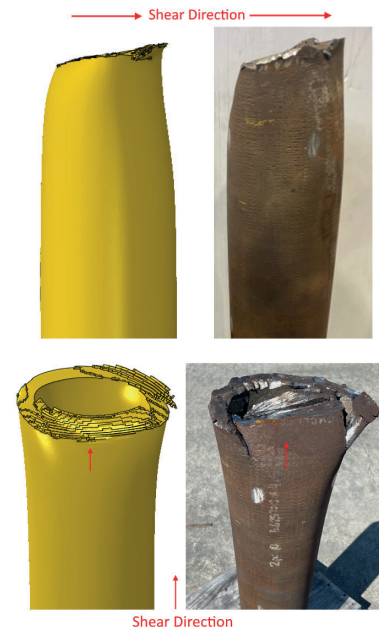
13-10M K-BOS Shearing predictive model vs actual shown for 6-5/8" OD HWDP 0.813 WT S135