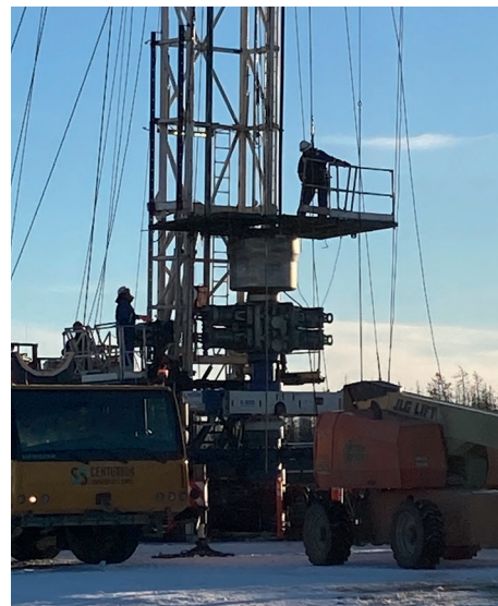
Shown Right: K-BOS added to the stack as an additional barrier where stack height is not a limiting factor.