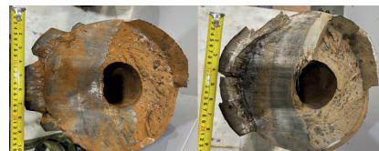
9.5" OD Drill Collar 214ppf, MYS 120