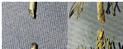
0.3125" Braided E-Line / 0.125" Slick Line