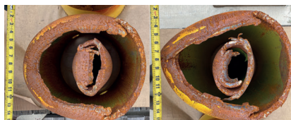
16" OD HP Casing, Q125 6-5/8" OD Inner String, V150 Combined 186ppf