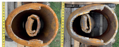
18" OD Casing, P110 6-5/8" OD Inner String, V150 Combined 167ppf